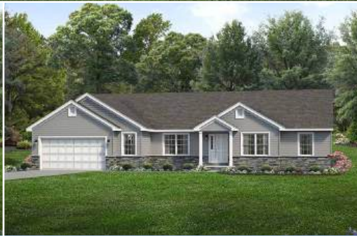
Family II Exterior