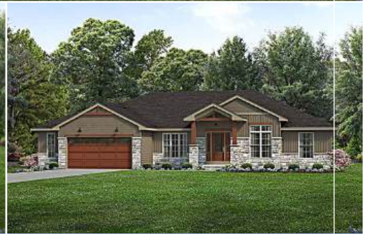
NEW! Homestead Exterior

More exteriors and details at WayneHomes.com