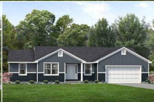
Smart Style Exterior