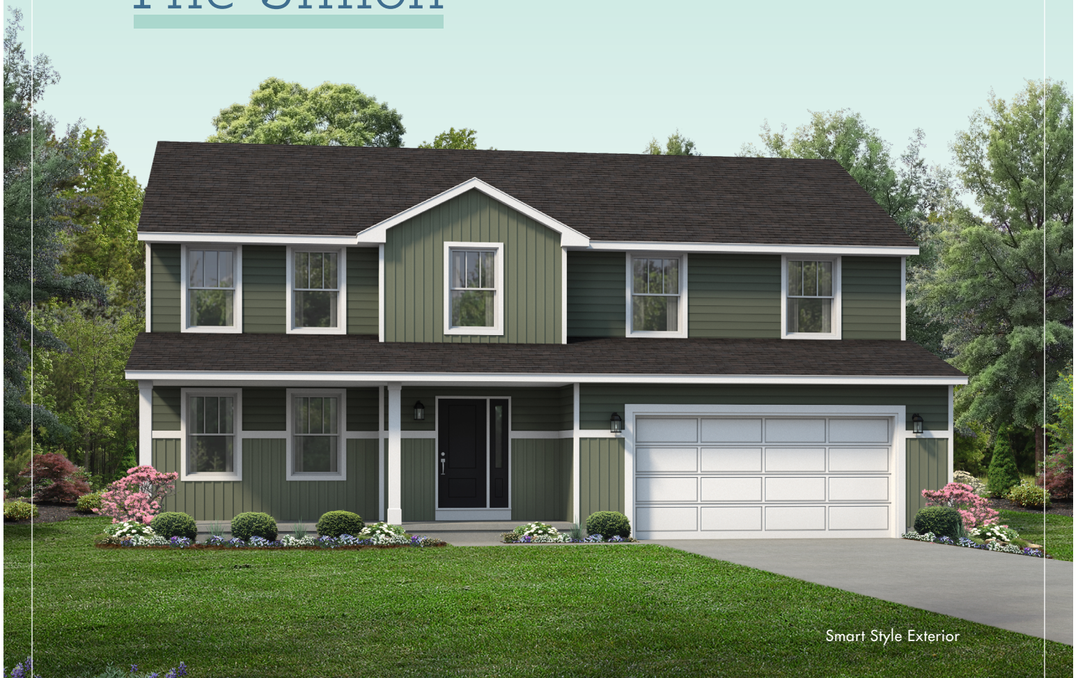
Smart Style Exterior